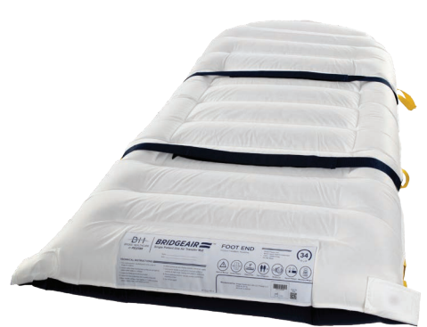
BridgeAIR™ Mattress Single Patient Use Full, 34" x 78"