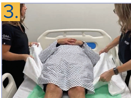
3. Use the draw or bed sheet to reposition the patient to the center of the bed or stretcher.