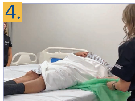
4. Remove the SlideMate by gently pulling it out from beneath the patient, working either from head to toe or toe to head. Always remove the SlideMate immediately after the transfer and repositioning is complete.